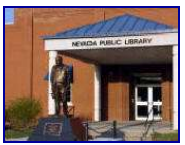
Nevada Library and Bushwhacker Museum