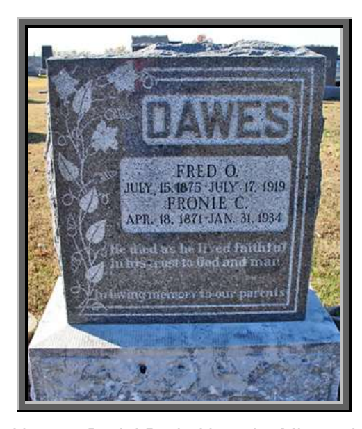
Newton Burial Park, Nevada, Missouri