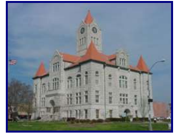
Vernon County Courthouse Nevada, Missouri

Tri-County Genealogical Society (Vernon-Cedar-St. Clair Counties) c/o Nevada Public Library 218 W. Walnut St.; P.O. Box B Nevada, MO 64772 TriCountyGenealogy @ starband.net http://www.rootsweb.com/~motcogs/