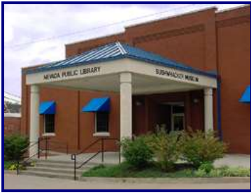
Nevada Library and Bushwhacker Museum

Tri-County Genealogical Society (Vernon-Cedar-St. Clair Counties) c/o Nevada Public Library 218 W. Walnut St.; P.O. Box B Nevada, MO 64772 TriCountyGenealogy @ starband.net http://www.rootsweb.com/~motcogs/